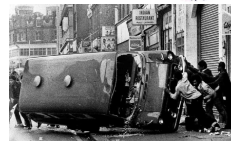
Scenes from the Brixton Riots