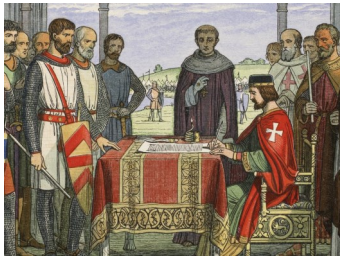
The signing of the Magna Carta

working class - the social group consisting primarily of people who are employed