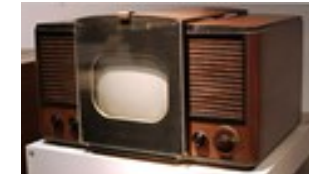
The first mass produced television