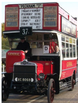
An example of an early Peckham bus.

Geographical Concepts: boundaries, change, climate, interdependence,