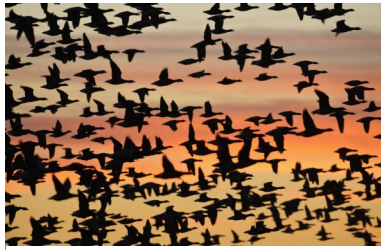
Birds migrating to avoid cold temperatures.

Thermometer - an instrument used to measure temperature