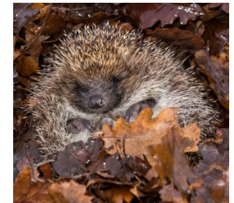
A hedgehog preparing to hibernate.