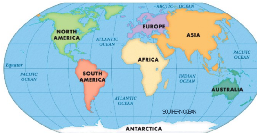
A map of the world showing the seven continents and five oceans.