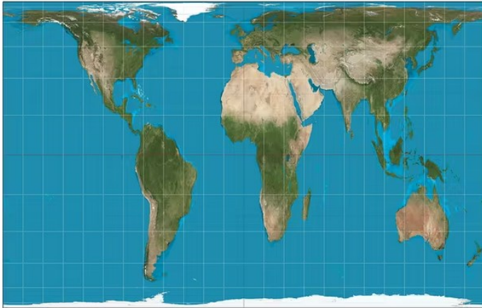
A map showing the correct size of the seven continents.