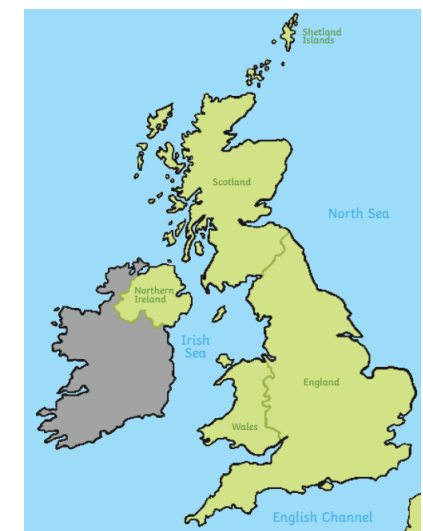
A map showing the seas surrounding the UK.