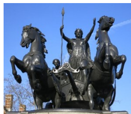
The Boudica statue

Taxes - a compulsory payment to a country's money to be spent to improve that country