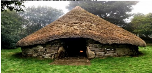
A Bronze Age roundhouse