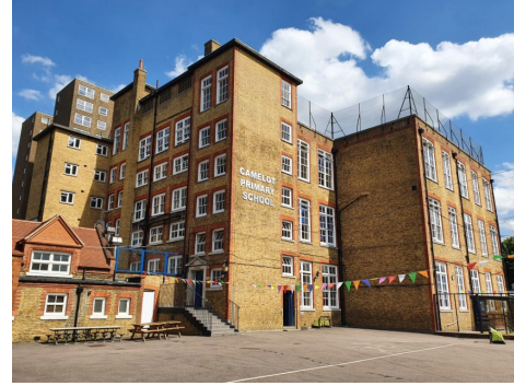
Food is transported all over the world by boats and lorries. Dover, Kent, is a major UK port.