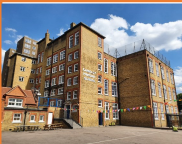
Camelot Primary School is an example of a human feature