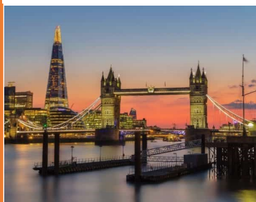
The River Thames is an example of a physical feature