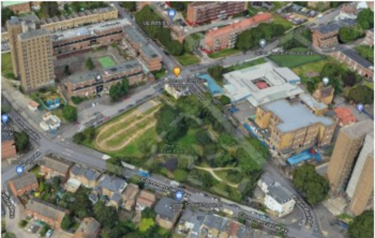
Aerial of Bird in Bush Park