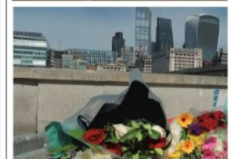
Tributes to Jimi at the scene of the accident