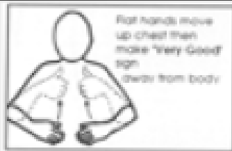
How are you?