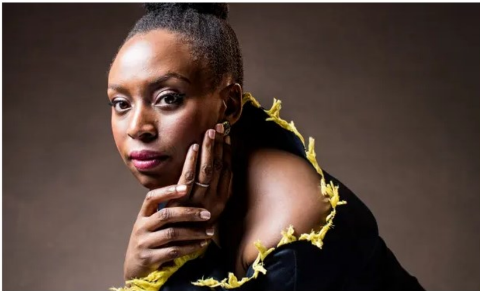
▲ 'Especially moved'... Chimamanda Ngozi Adichie.

Nigerian author's novel Half of a Yellow Sun , which won in 2007, named the best book in the prize's 25-year history by the public