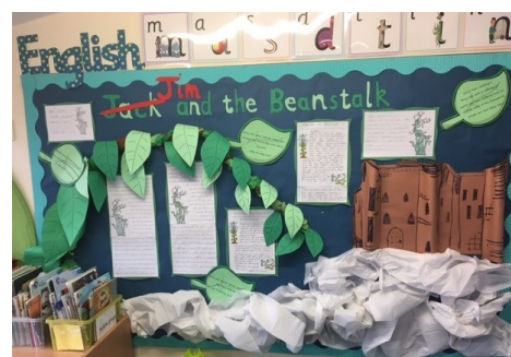
The displays around our school are exceptional—come and see your child's class displays