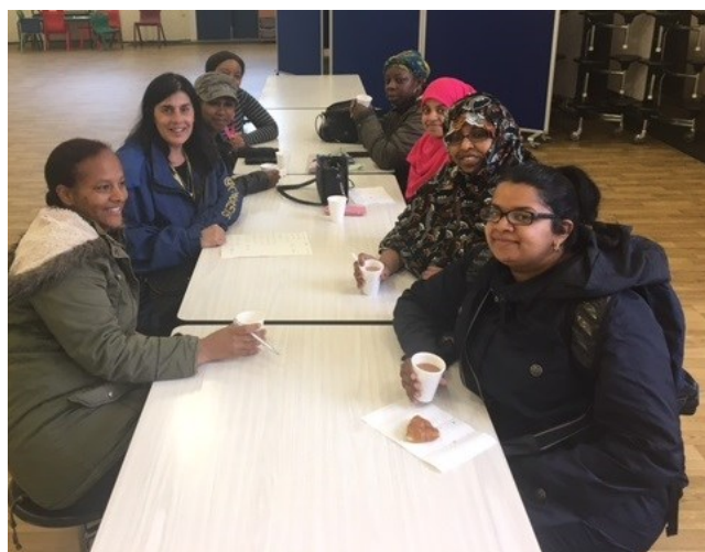
The new Summer Fair PTA planning