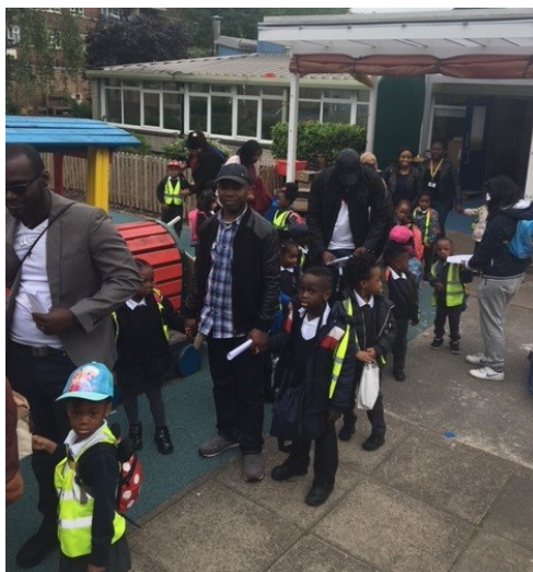
Exceptional trips all term