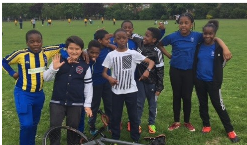
Exceptional Cricket Team—unbeaten in league so far